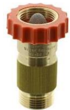
Water pressure regulator

Look for a white-water hose stored in a bin in the biggest storage compartment toward the rear of the RV (Driver's side). Connect the male end of the garden hose to the "Fresh Water Connection" on the RV. Connect the female end to the water supply at the campsite. Make sure a "Water Pressure Regulator" is connected between the camp site's water supply and the white hose. If not, the water pressure may cause damage within the RV water system. Finally, turn on the water from the campsite faucet.